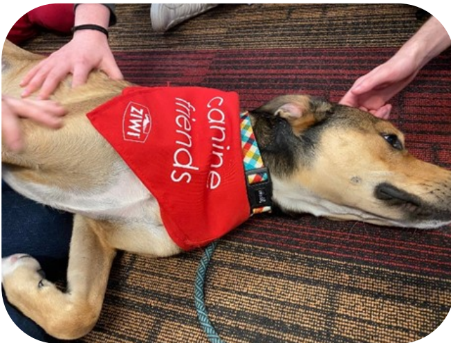
Our new member, Fudge, enjoying lots of pats