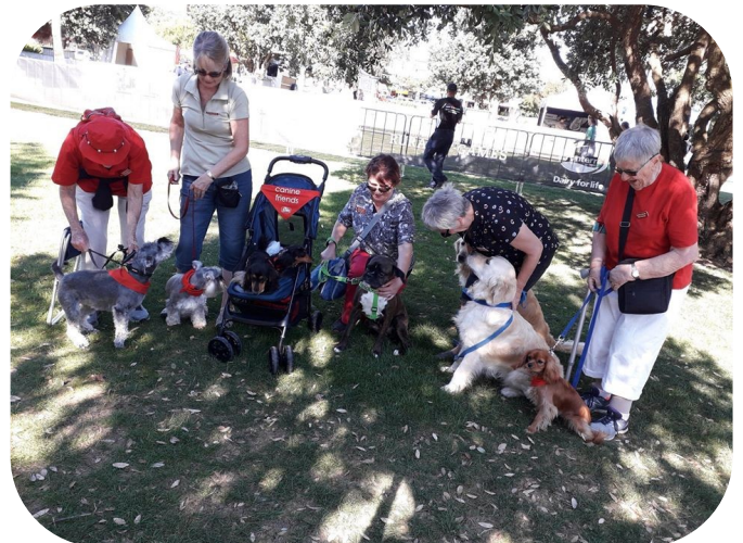
Members mingling over the two days at the Games