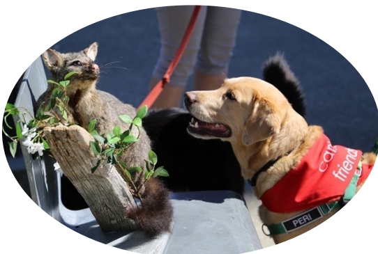
Peri meets an opposum