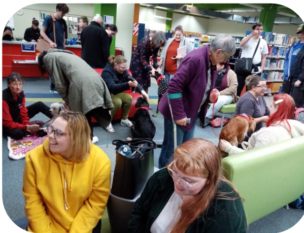
Across the room