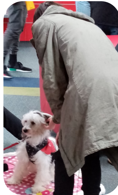
Bingo enjoying pats