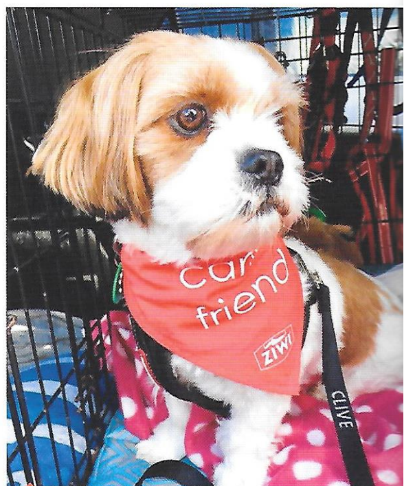
▲ Butter would not melt ... Clive the new pet therapy dog