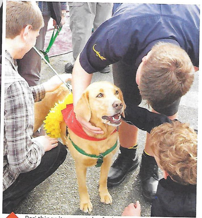
Peri things its a great day for it