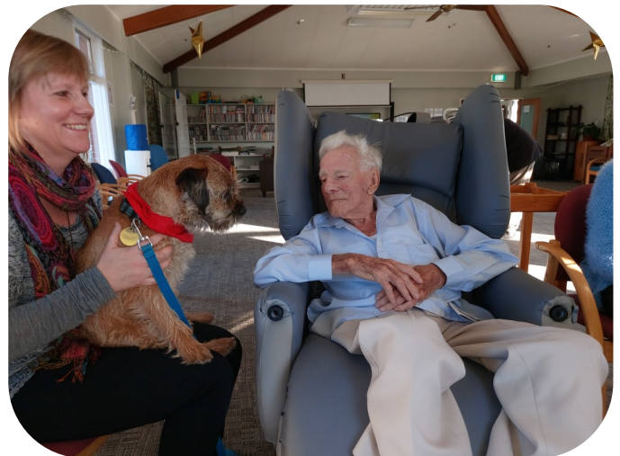
Her name is Ella, she is a rescue dog whom we will have had almost a year with now, (middle of Sept), and she is currently in training for search and rescue kind of work (Scent work & Tracking) in which she is doing very well ! Ella loves visiting the Rest Homes too.