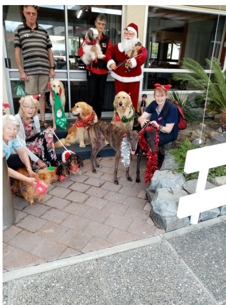
Group (Tess, Zara, Mocha, Con, Oakie, Thumpa. Bingo, Coffee & Brandy

My apologies for these photos appearing late in the year (Editor)