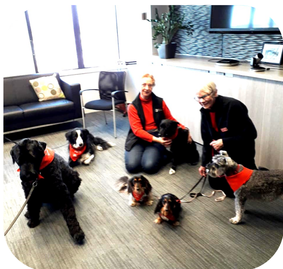
Fitzherbert Rowe Palmerston North visited by Kazan, Mouse, Brody, Zara, Mocha and Murphy