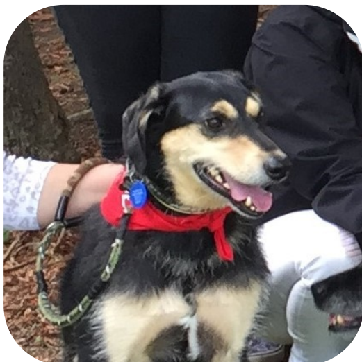
Nesta at the Marton Harvest Festival on March 17