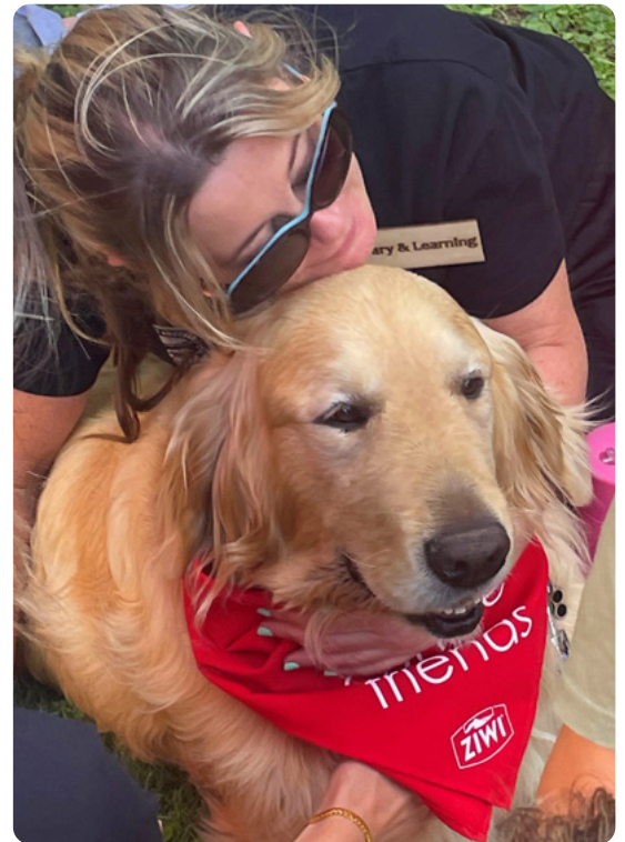
Thumpa visiting UCOL, Palmerston North.