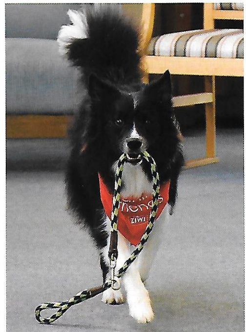
Jack says, let's get this show on the road