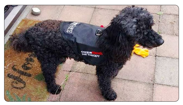
Carol Drew's Venus - Poodle