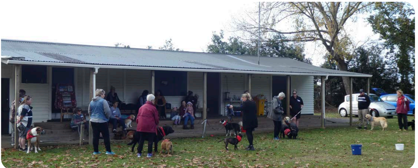
Waikato Founder's Day.