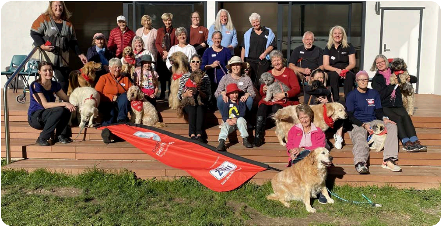
Founder's Day Event – Hutt Region members together at Belmont Hall.