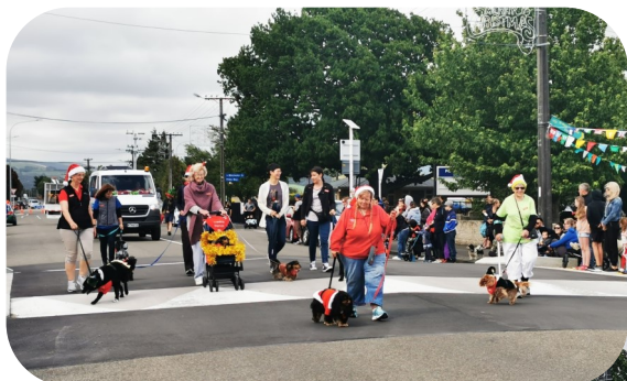
Marching to the Band