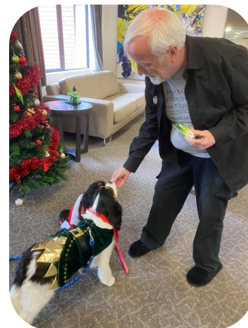
Treat time for good dogs