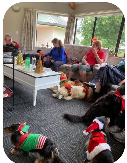
Afternoon Tea at Peppertree with very relaxed dogs