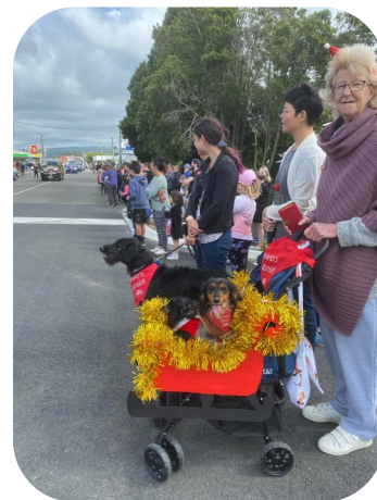
Our members watching