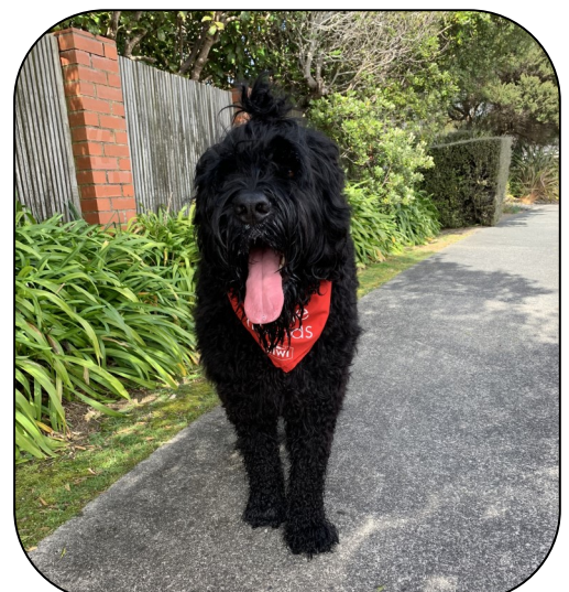
Photo of gorgeous Fozzie going visiting