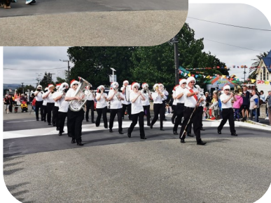
Band leading the Parade