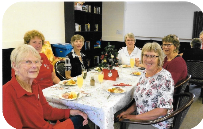
The Luncheon Table

On Saturday 5 December it was our annual Christmas visit to two Palmerston North Resthomes. The morning started with a visit to Woodlands of Palmerston North where 15 dogs were in attendance. Woodlands is a big beautiful old house and we found that we had over catered in our dog power but all still had a lovely visit and the residents had many lovely pats and cuddles with our dogs. It was also great to see some new members joining in this event and all should be very proud of their dogs.