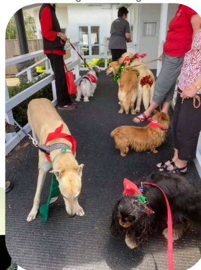
Waiting to go in