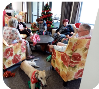
Relaxing in the Lounge