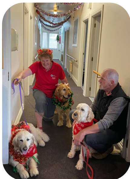
Sophie, Oakie and Bailey