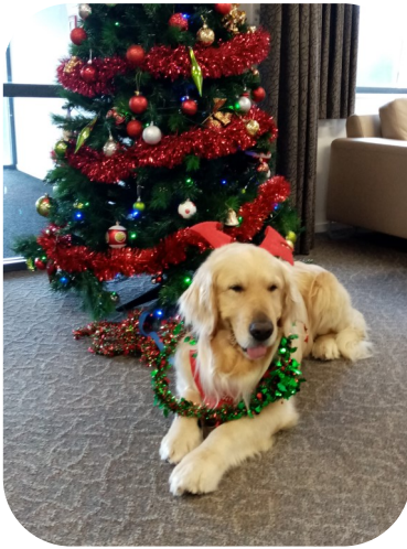
Thumpa by the Xmas tree at Ranfurly RCC in Feilding