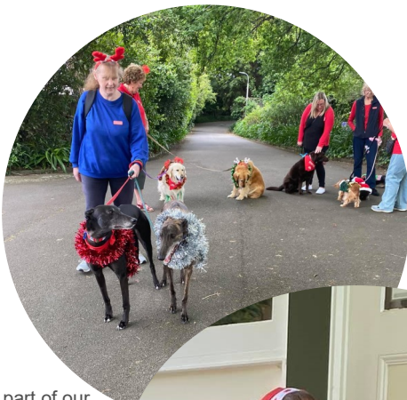
part of our group waiting to start our visit